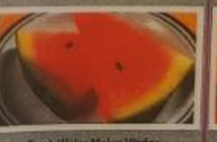
Fresh Watermelon Wedge