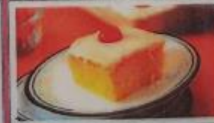
Iced Sponge Cake