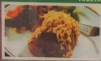
Jackal Potato with a Selection of Fillings Served with a Side Salad