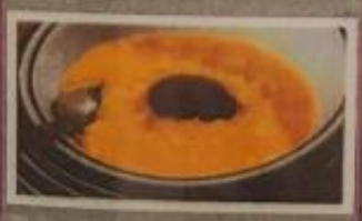
Rice Pudding & Jam