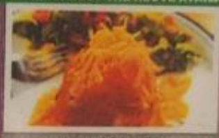
Jackal Potato with a Selection of Fillings Served with a Side Salad