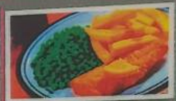
Battered Fish (MSC) served with Chips & Peas or Baked Beans

VEGETARIAN VERSION OF THE ABOVE AVAILABLE DAILY