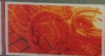
Golden Crunch Cookies

Available every day - Unlimited Salad, Freshly Baked Bread, Organic Yoghurt, Fresh Fruit Platter, Milk & Chilled Water.