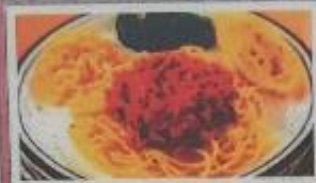
Spaghetti Bolognese served with Garlic Bread & Seasonal Vegetables