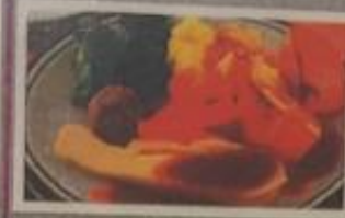
Roast of the Day served with Roast/Mashed Potatoes, Seasonal Vegetables & Gravy