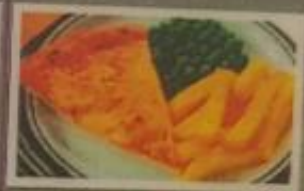
Cheese & Tomato Pizza served with Chips & Pasta or Baked Beans

VEGETARIAN VERSION OF THE ABOVE AVAILABLE DAILY