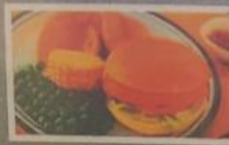
Crispy Chicken Burger served in a Bun with Potato Wedges & Seasonal Vegetables or Baked Beans