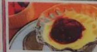
Yoghurt & Fruit Compote