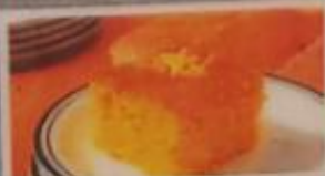
Lemon Drizzle Cake