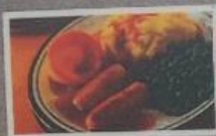
Sausages & Yorkshire Pudding served with Mashed Potato, Seasonal Vegetables & Gravy