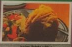
Jackal Potato with a Selection of Fillings Served with a Side Salad