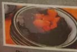
Chocolate Meringue Springs & Custard