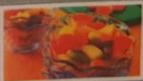
Fresh Fruit Salad