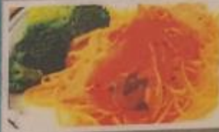
Sweet Chili Chicken served with Noodles & Seasonal Vegetables