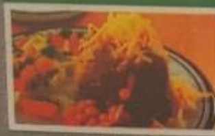
Jackal Potato with a Selection of Fillings Served with a Side Salad

VEGETARIAN VERSION OF THE ABOVE AVAILABLE DAILY