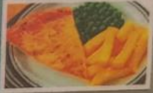
Cheese & Tomato Pizza served with Chips & Peas or Baked Beans

VEGETARIAN VERSION OF THE ABOVE AVAILABLE DAILY