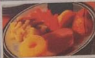
Roast of the Day served with Roast/Mashed Potatoes, Seasonal Vegetables & Gravy