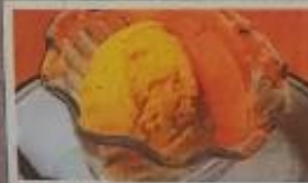
Ice Cream & Fruit