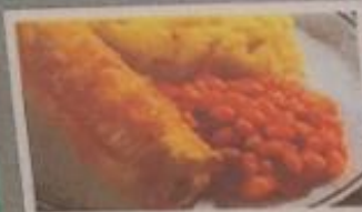
Homemade Sausage Roll served with Mashed Potato & Baked Beans