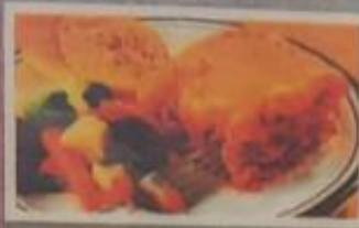
Lasagne served with Garlic Bread & Seasonal Vegetables