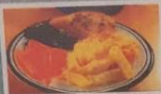
Mac 'n' Cheese served with Crusty Bread & Seasonal Vegetables