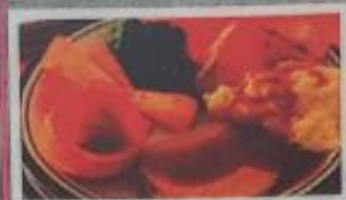
Roast of the Day served with Roast/Mashed Potatoes, Seasonal Vegetables & Gravy