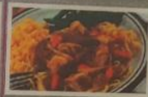
Chicken Chow Mein served with Noodles & Seasonal Vegetables