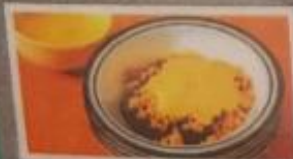
Fruit Crumble & Custard