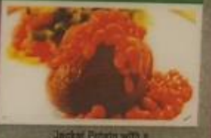
Jackal Potato with a Selection of Fillings Served with a Side Salad